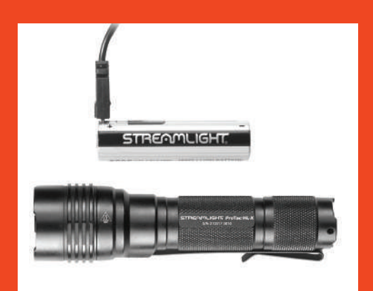
PROTAC® HL-X USB