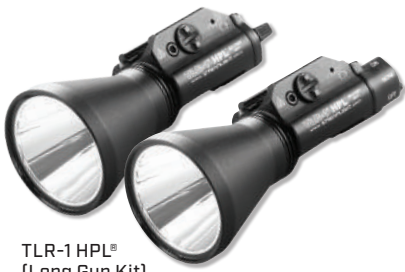
(Lona Gun Kit) WHITE LIGHT ILLUMINATOR