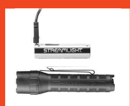
POLYTAC® X USB